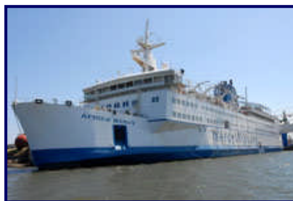
Top: Each year, more than 1,200 surgeons, dentists, nurses, health care trainers, teachers, cooks, seamen, engineers, or agriculturalists volunteer their time and skills with Mercy Ships. Bottom: The Africa Mercy.